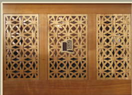
Opus 69 pipe shades