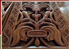
Hadley chest inspired carving for opus 68